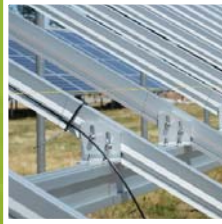
PV Mounting Kits