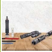
PV Cabling Kits